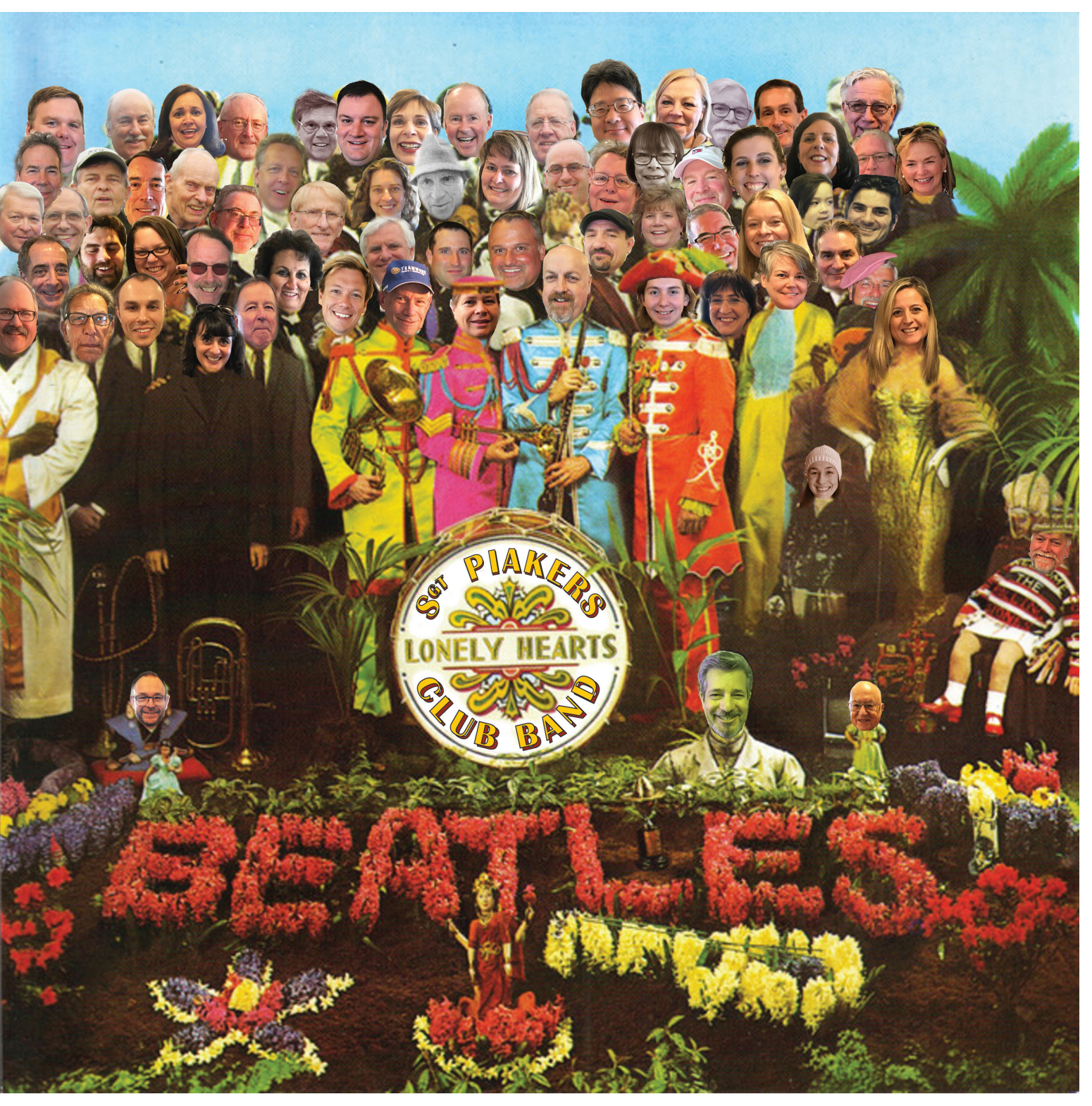
Ahhhhhhhhh, look at all the lonely people...